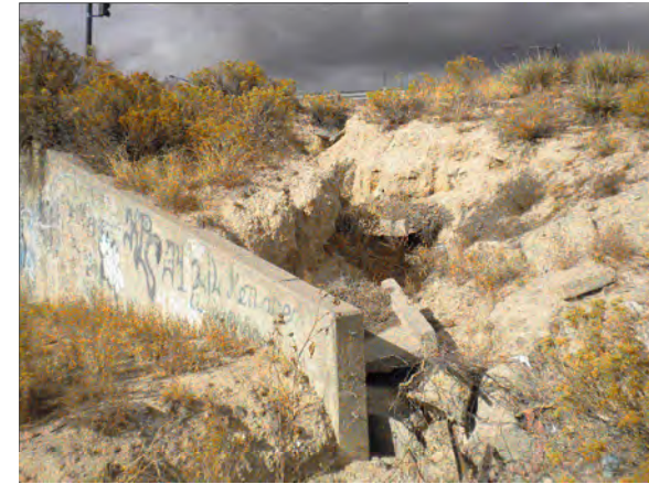
EROSION AT SOUTHEAST WINGWALL